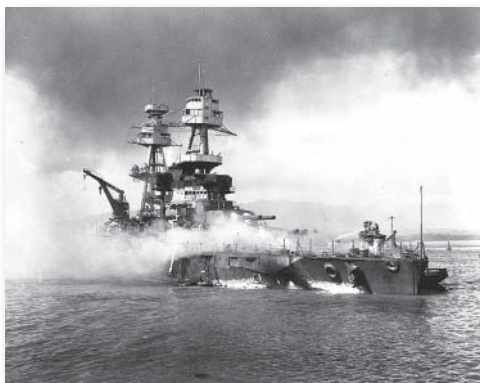
USS Nevada on December 7, 1941

Thomas ran topside and immediately began working with other members of the crew to fire at the Japanese bombers attacking the American fleet. But the surprise attack was devastating.